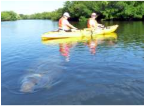
Photo by Al Hufschmidt, FOLKS member who explains that "our kayak was approached by a few manatees, and one of them slowly pushed our kayak around - full circle - with its nose."

West Indian manatees in the United States are protected under federal law by the Marine Mammal Protection Act of 1972, and the Endangered Species Act of 1973, which make it illegal to harass, hunt, capture, or kill any marine mammal.